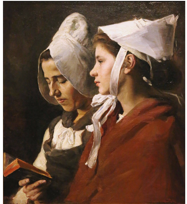
Elizabeth Nourse, Two Women, 1892