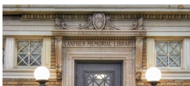
Lanpher Memorial Library