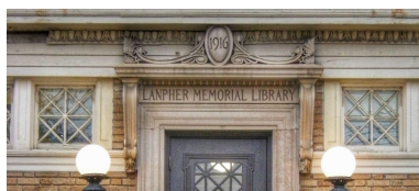
Lanpher Memorial Library