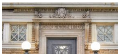
Lanpher Memorial Library