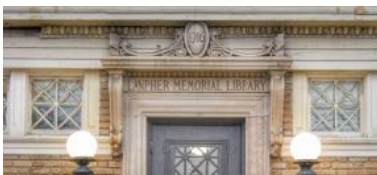
Lanpher Memorial Library