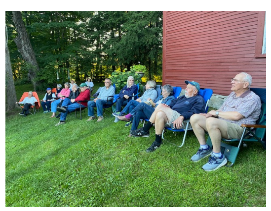
We had a wonderful evening of entertainment with Carrie and D. The good feeling from the fabulous music lasted for days.