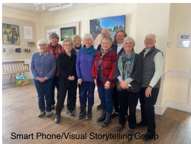
Smart Phone/Visual Storytelling Group