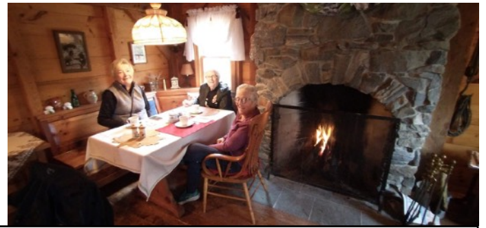
Tea/coffee and confections were enjoyed at the Fledermaus Barn in Johnson.